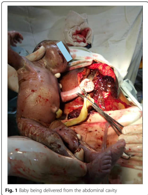
Fig. 1 Baby being delivered from the abdominal cavity

Our patient presented with severe abdominal pain during fetal movements. The fetal presentation was not well defined on exam. Although easy palpation of fetal parts has been reported as a sign of abdominal pregnancy, this was not possible in the current case because the patient had a tense abdomen. Complaint of painful