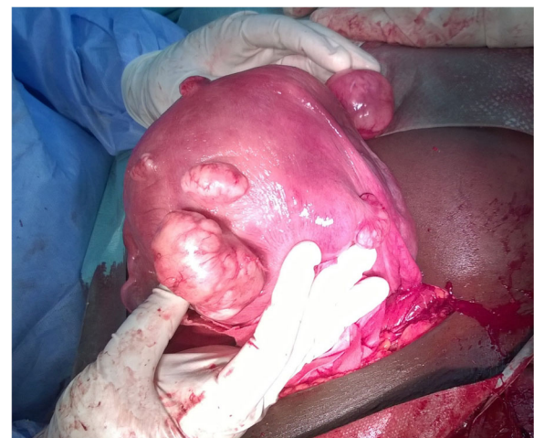
Fig. 2 Intraoperative findings; anterior sub-serosal myoma in necrobiosis and posterior sub-serosal myoma

will be carried out within the same operation. Preoperative management consisted of placing two peripheral venous lines of large bore needle with infusion of 1000 ml of normal saline, parenteral administration of an analgesic (paracetamol 1 g), an antihypertensive drug (nicardipine 2 mg bolus) and anticonvulsant (magnesium sulphate 5 g intravenously followed by 4 g intramuscularly in each gluteus muscles). A Pfannenstiel incision performed five hours after admission permitted the extraction of a life female baby who weighed 3300 g at birth with an APGAR score of 8 and 10 at the first and fifth minutes respectively. Intraoperative findings of an anterior and posterior sub-serosal leiomyomas both measuring about 50 mm (Fig. 2); anterior fibroid had an axis pointing to the umbilical ring, with irregular contours and a heterogeneous center, strongly suggestive of aseptic necrobiosis. In addition, the uterus also had several interstitial myomas. The uterine adnexae and the appendix were macroscopically normal. The herniated omentum was not necrosed. No intestines necrosis was