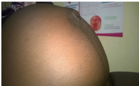
Fig. 1 Umbilical swelling

A multidisciplinary team involving general surgeons, obstetricians and anaesthesiologists decided on a two-in one intervention whereby an emergency caesarean section with indication severe pre-eclampsia, and a herniorrhaphy with indication strangulated umbilical hernia