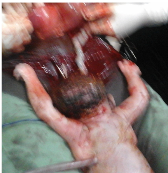
Fig. 1 Dead new born extracted from the abdominal cavity

An emergency laparotomy was then indicated for suspicion of abdominal pregnancy or uterine rupture. At the opening of the peritoneum, a bloody fluid (most likely blood, amniotic fluid and peritoneal fluid) was sucked up. The fetus that bathed in the abdominal cavity was extracted dead and macerated (Fig. 1). It weighed 3300 g and did not have any malformation. The placenta was fully inserted into the hypertrophied and ruptured