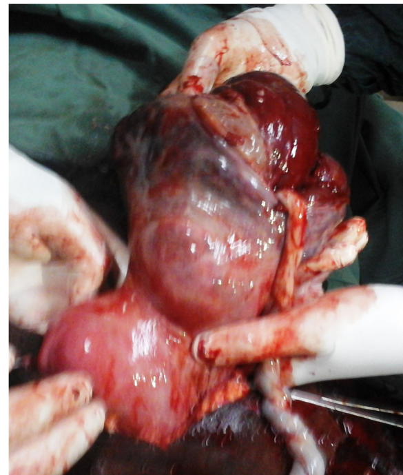
Fig. 2 Hypertrophied and ruptured isthmus with the placenta within it

The implantation of the embryo in the abdominal cavity can be primitive or secondary. It is primitive in case of direct implantation of the embryo in the abdominal cavity. It is secondary when it occurs after a ruptured tubal pregnancy or a tubal abortion or even a uterine rupture