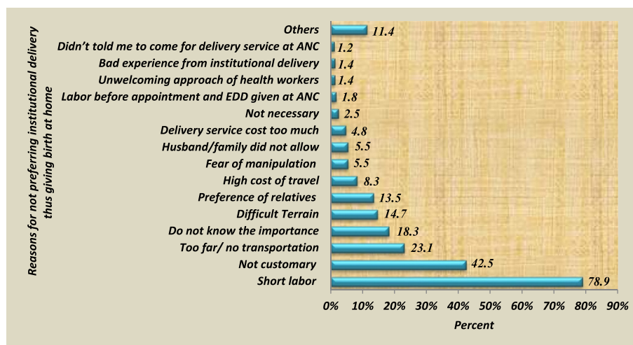
Fig. 2 Reasons given by women for not preferring institutional delivery thus giving birth at home in Cheha District, Ethiopia, December 2012 to January 2013 (more than one answer is possible)

to their 2 nd youngest child at home (OR = 7.23, 95 % CI: 4.14, 12.62) (Table 3).