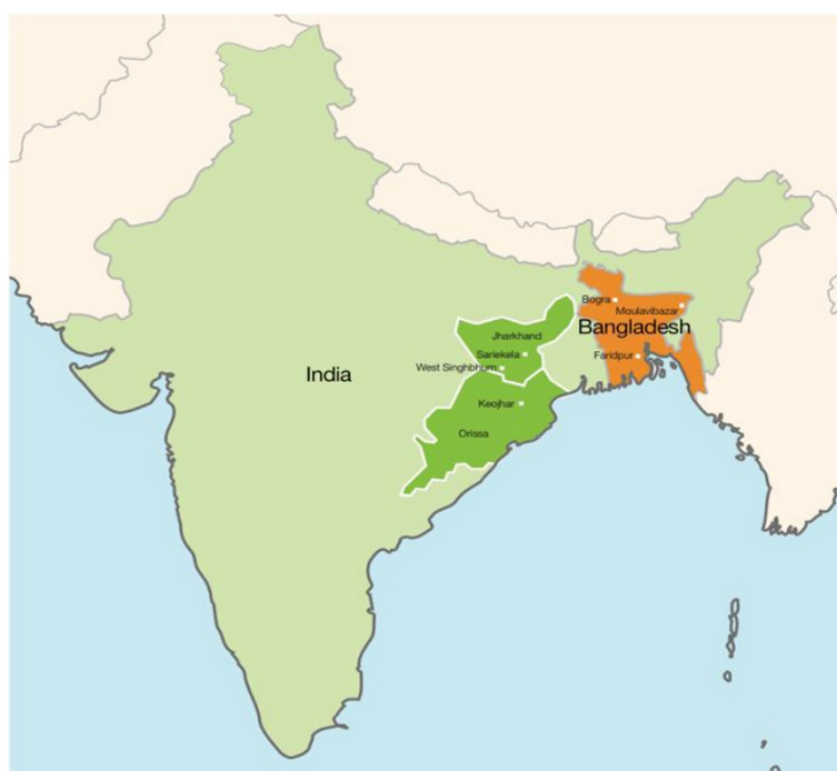
Figure 1 Map displaying the location of the different study sites.

fieldworker. Information about the individual surveillance systems can be found elsewhere [23-26].