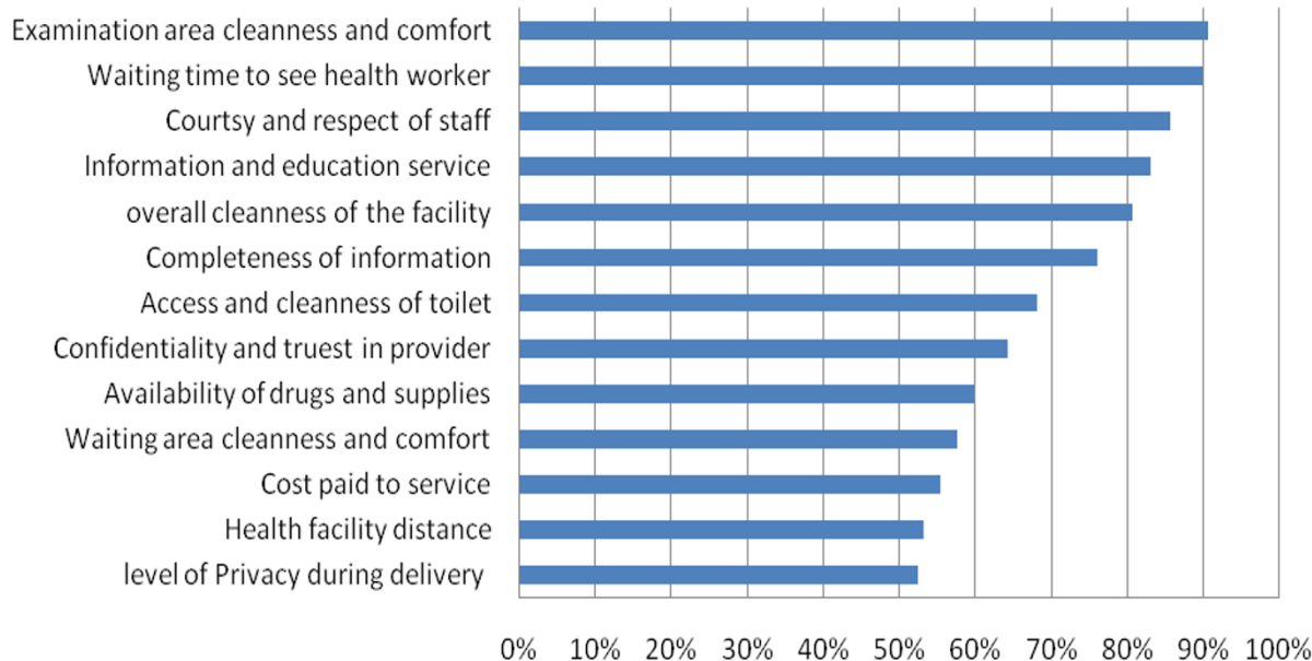
Figure 1 Major dimensions of care and average satisfaction scores by postnatal mothers delivered in 3 Referral hospitals in Amhara Region, Ethiopia.

In this study delivering mothers satisfactions was predicted by wanted status of the pregnancy, immediate