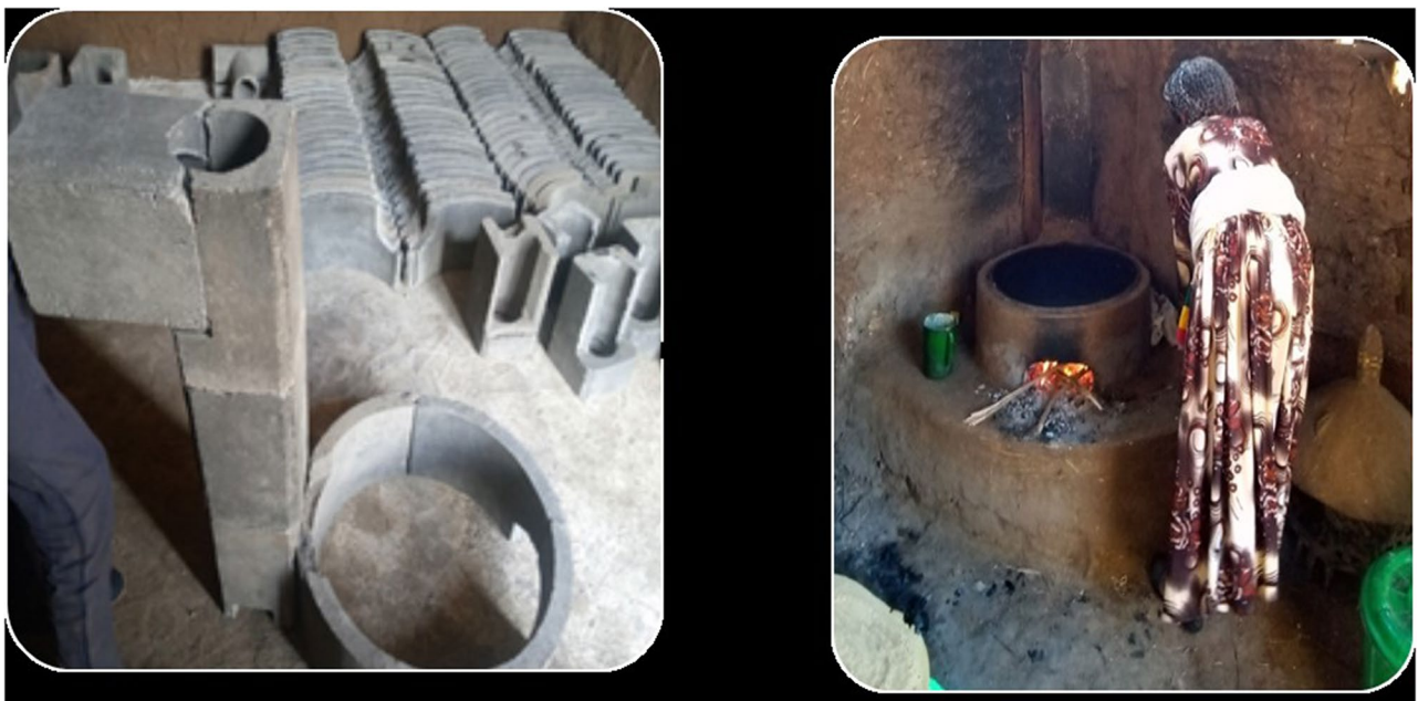
Fig. 1 Chimney fitted Mirt stove technology in the stock before installation and after the installation