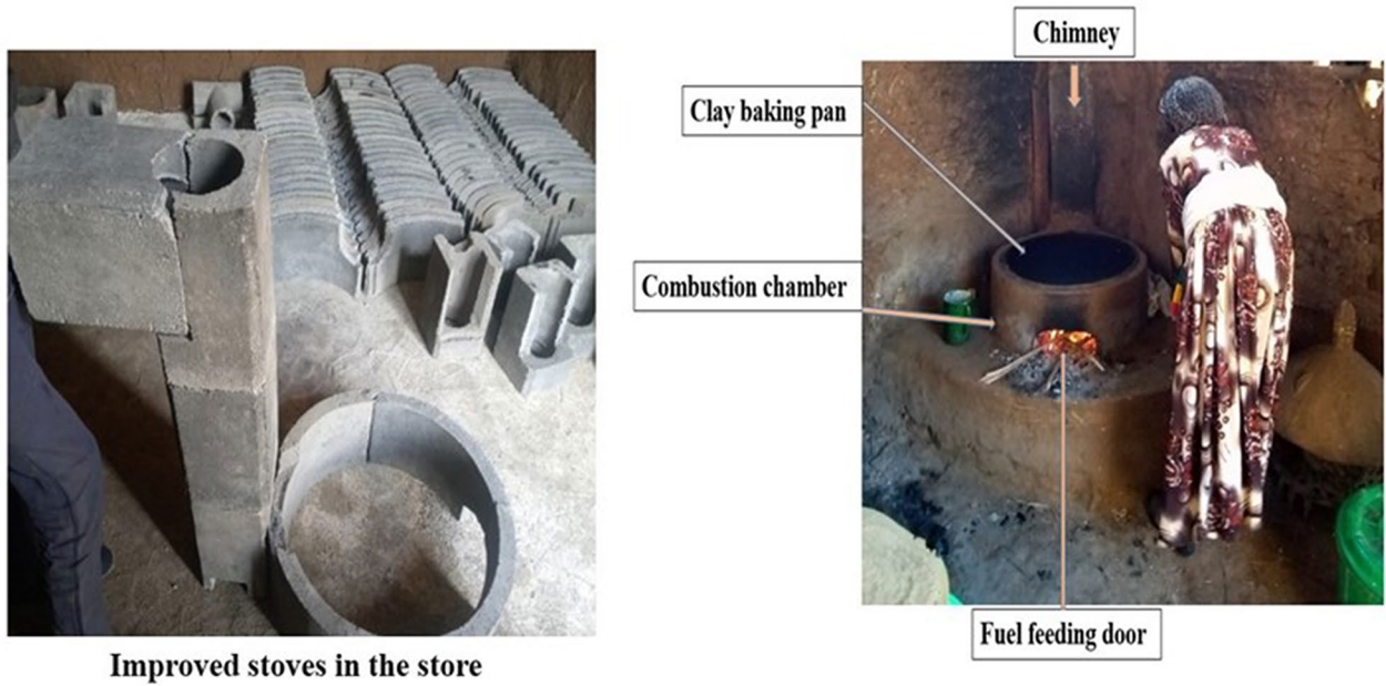
Fig. 1 Chimney fitted Mirt stove technology in the stock before installation and after the installation