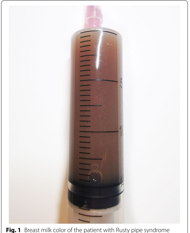
Fig. 1 Breast milk color of the patient with Rusty pipe syndrome (camera, HUAWEI P30pro)