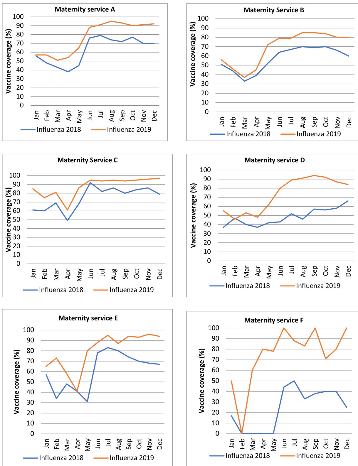
Fig. 2 Maternal influenza vaccine coverage per month (2018 compared to 2019) for each maternity service