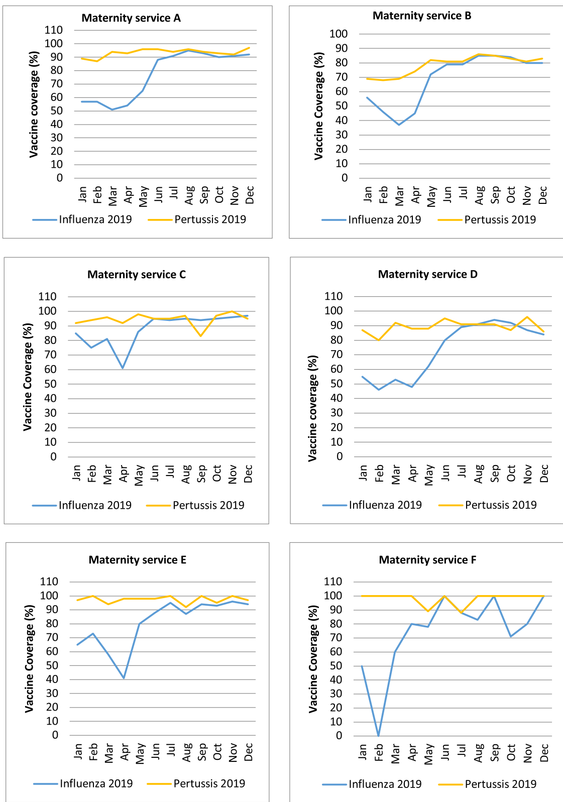
Fig. 3 Influenza and pertussis coverage 2019 per maternity service