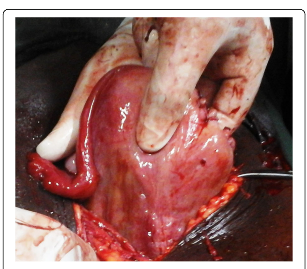
Fig. 4 Appearance of the uterus after the salpingectomy

The diagnosis of abdominal pregnancy is difficult [3, 5], and is an intra-operative finding in 40 to 50% of cases [3, 5], despite antenatal follow-up and ultrasound scan. The evolution of abdominal pregnancy when it is asymptomatic [3, 9], as in our case, raises the question of whether the clinical examinations were carried out appropriately. One would expect signs of hemoperitoneum