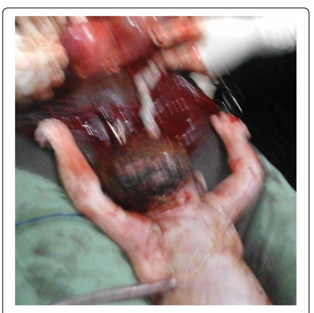
Fig. 1 Dead new born extracted from the abdominal cavity

An emergency laparotomy was then indicated for suspicion of abdominal pregnancy or uterine rupture. At the opening of the peritoneum, a bloody fluid (most likely blood, amniotic fluid and peritoneal fluid) was sucked up. The fetus that bathed in the abdominal cavity was extracted dead and macerated (Fig. 1). It weighed 3300 g and did not have any malformation. The placenta was fully inserted into the hypertrophied and ruptured