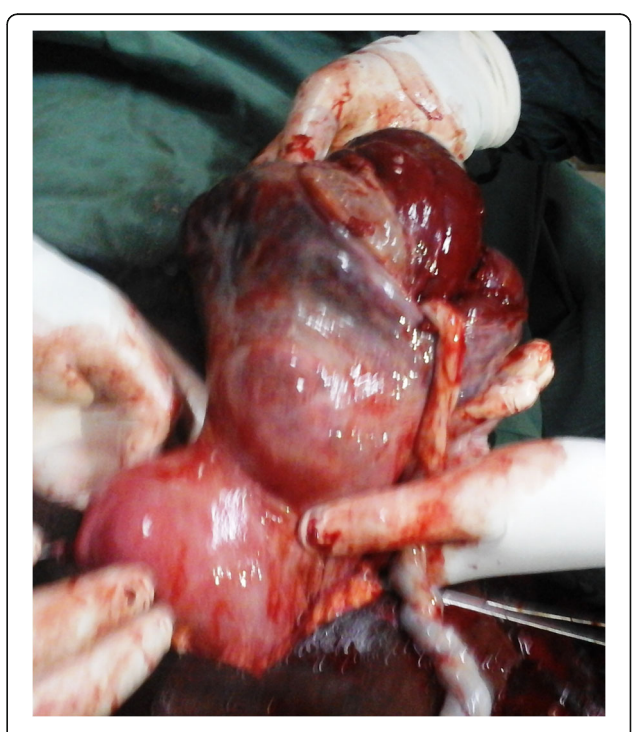
Fig. 2 Hypertrophied and ruptured isthmus with the placenta within it

The implantation of the embryo in the abdominal cavity can be primitive or secondary. It is primitive in case of direct implantation of the embryo in the abdominal cavity. It is secondary when it occurs after a ruptured tubal pregnancy or a tubal abortion or even a uterine rupture