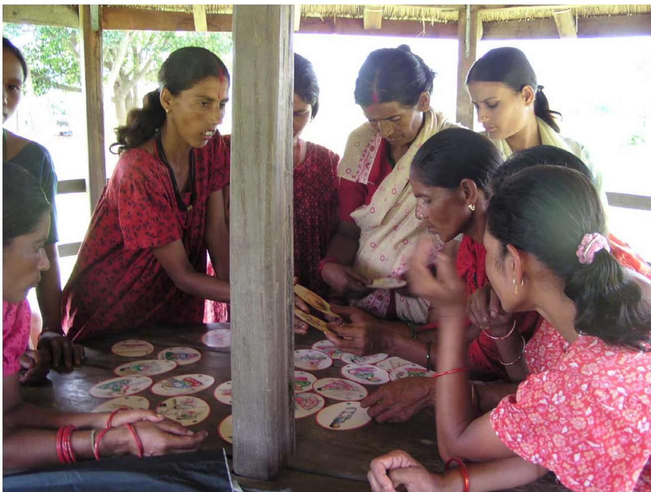
Figure 3 Women's group using picture cards