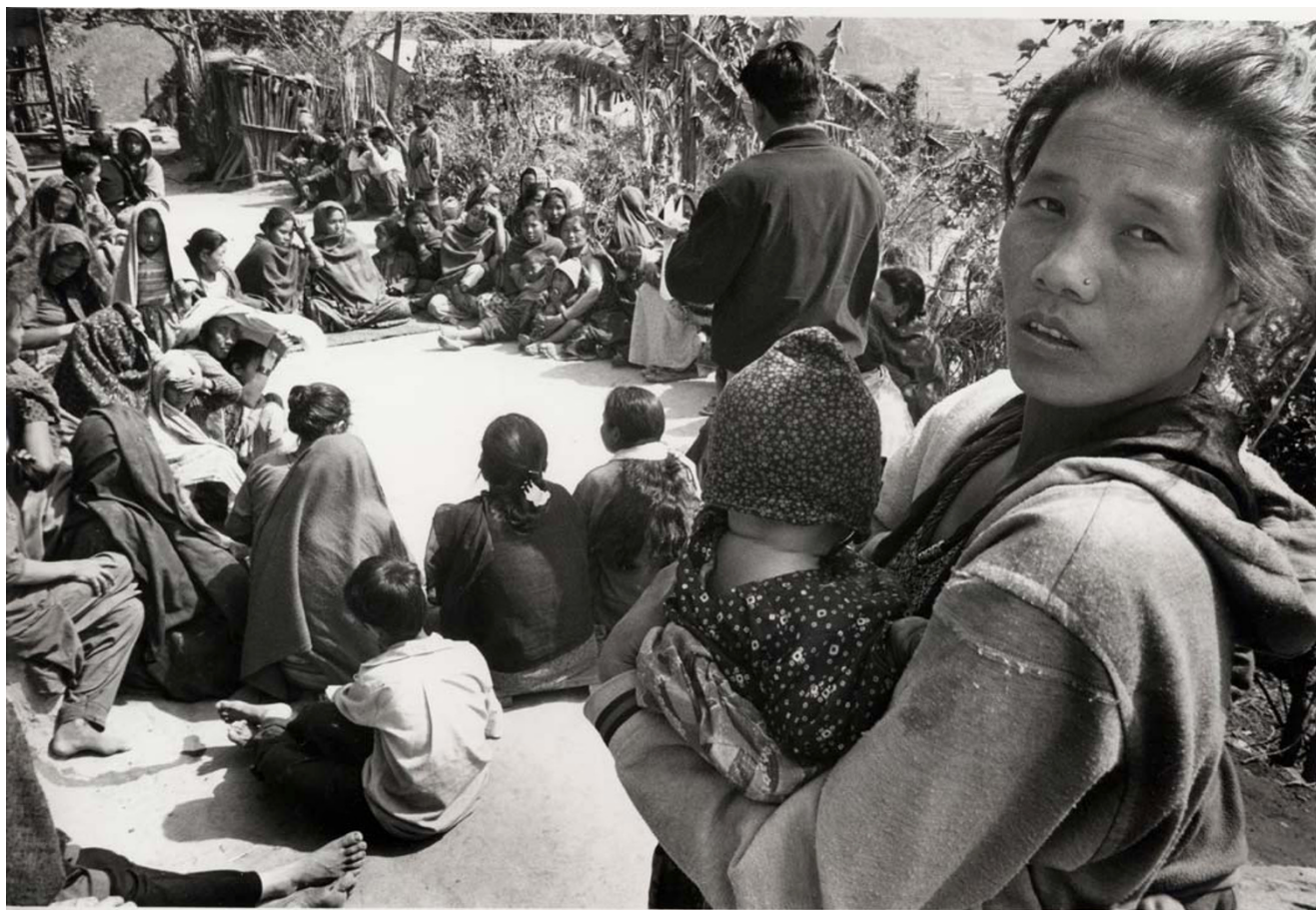
Figure 2 Women's group and facilitation manager