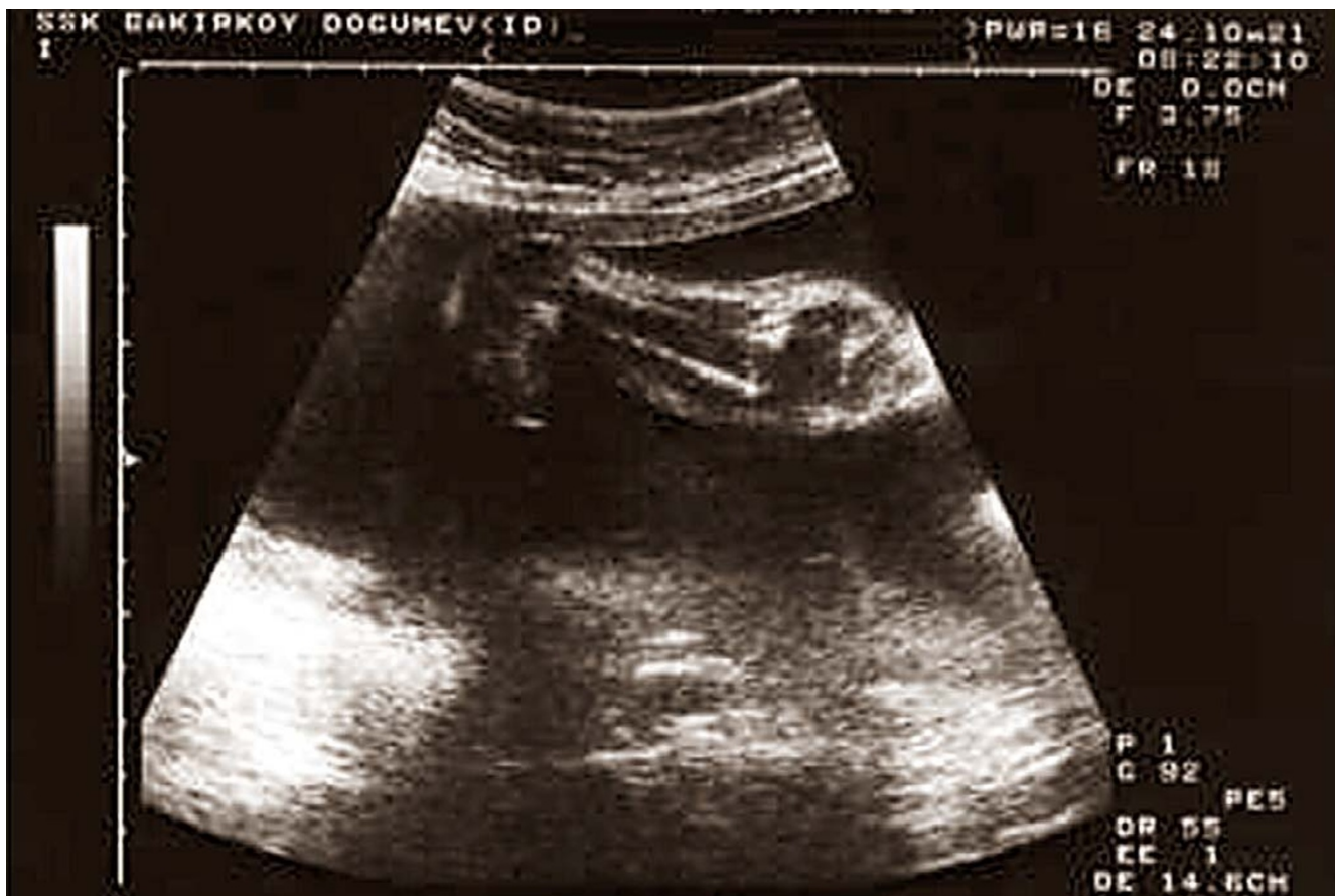
Figure 2 Ultrasound scan showing the deformity of foot.