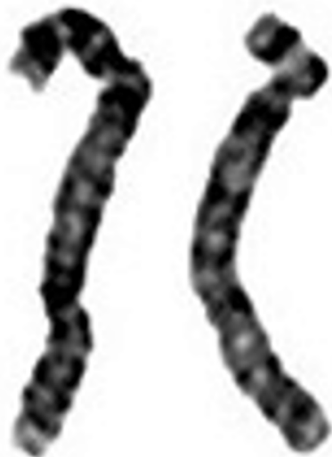
Figure 4 Note the deletion of short arm of the chromosome 4

4 and partial trisomy 18 in one living boy and a prenatally diagnosed male fetus. Both showed abnormalities consistent with WHS and had in addition aplasia of one umbilical artery [9].