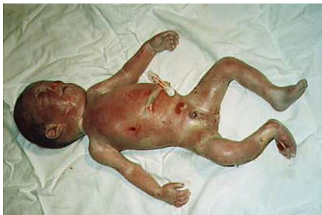
Figure 3 Photograph of the neonate with the Wolf-Hirschhorn syndrome. Note the hypospadias and calcaneovalgus deformity of the foot.

subtle dysmorphic features suggesting WHS: hypertelorism, prominent glabella, short philtrum, and carp-shaped mouth. Although high-resolution chromosomal analysis was normal in the child and in both parents, molecular analysis indicated that the child had not inherited a maternal allele for probes from 4p16. Fluorescence in situ hybridization (FISH) in the mother showed a submicroscopic translocation between chromosome 4 and 10. Chen et al [8] reported on the prenatal diagnosis of two sib female fetuses with a satellited short arm of chromosome 4 and a male fetus with a satellited long arm of chromosome X. The first two fetuses had a cryptic balanced translocation t(4;15)(p16;p11.1) inherited from a mother carrying a satellited 4p and having an affected child with the Wolf-Hirschhorn syndrome.