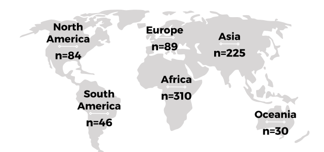
Fig. 2 Global distribution of studies within included systematic reviews. Values represent the number of studies within the included systematic reviews that were published within the labeled continent. Studies not reported: Malavist 2012, Jhaveri 2021

PROGRESS-Plus factors, however, Tables 2 and 3 summarize the data into each of the factors. A condensed summary of equity related outcomes for each included review can be viewed in Supplementary file 4.