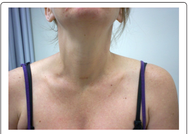
Figure 2 Cosmetic result at 6 weeks post surgery.

In 1947 Petit and Clark successfully treated a patient suffering from GPHPT [10]. Under local anaesthesia and supplemented only by nitrous oxide and oxygen, they were able to remove a palpable parathyroid adenoma